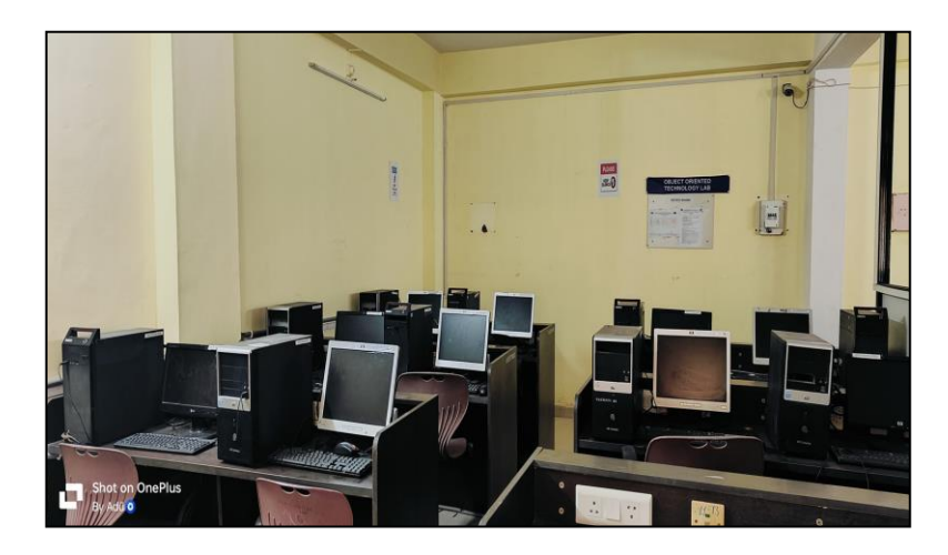
Object Oriented Technology Lab