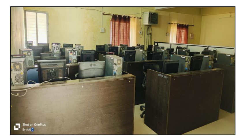
Operating System Lab

Each laboratory is well equipped with advanced computing facilities to caterto the needs of development of innovative projects. Internet Connectivity is readily available in the laboratory.