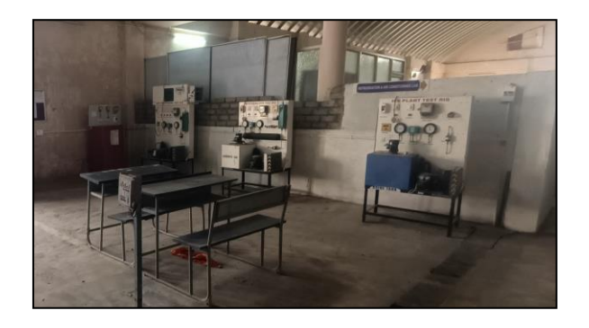
Fluid Dynamics Lab