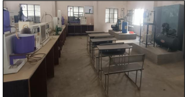
Heat Transfer Lab